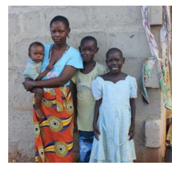
Tanzania Dail Community