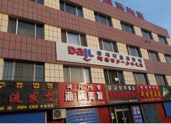
Former Dail China

those in college, and furthermore, for the financial support for the students from disadvantaged families in Hunchun and for the projects that we have brooded over for last twenty years, eyeing the children in North Korea across the Duman (Tumen) River. So far, our work has been focused on child care. From now on, we will follow our newly given path beyond Hunchun, China across the Duman River all the way to Vladivostok, Russia.