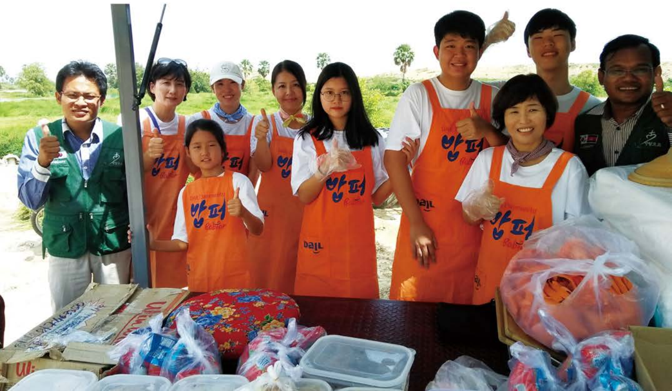
With “Love Full in Both Hands” team in front of the Mobile Babfor food truck.

Distributing cooked rice and bread to over 500 people in the location required a food truck. After we spent some time trying to figure out a solution, we decided to run a project fundraiser together with the “Love Full in Both Hands” team made of local Korean mothers and children who frequently joined volunteering at the center. Thus, the fundraiser launched on “Value Together with Kakao” on June 30 with a view to buying a food truck. More people chipped in than we first thought and with