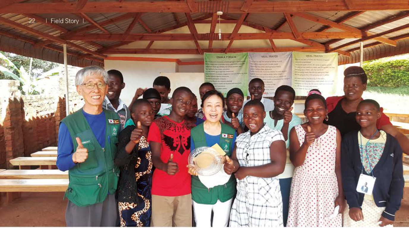
With young dreamful children on support programs who continue to grow as middle school students