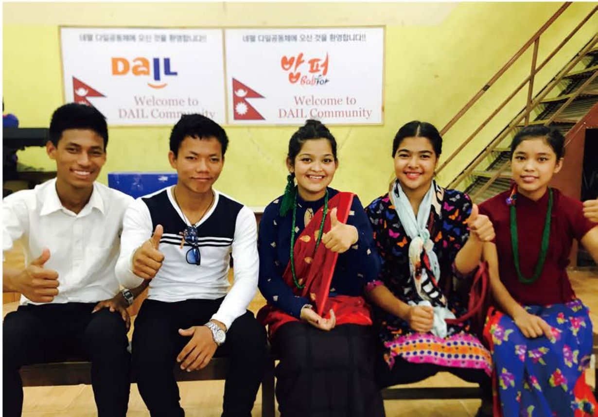
Children in the eleventh grade.

Press 6 after hearing the ringing sound related to contents (International Projects Department)