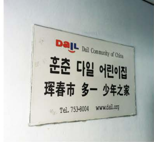
Plaque of former Dail Children's House.

Many people who love Dail Community in China continuously give their support and sponsorship. The current one-on-one child sponsorship program will continue. In financially and emotionally supporting children who need to adapt to their new environment, Dail Community in China is put-