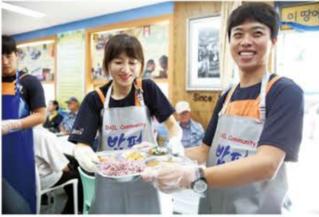
NC Dinos players carrying food trays.