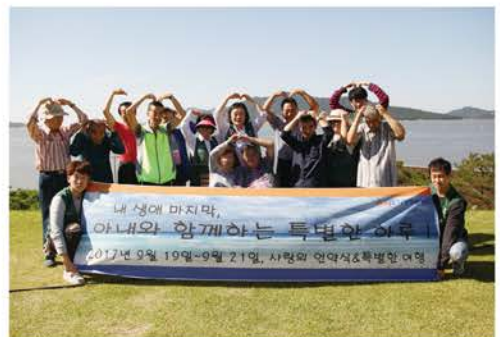
On Ganghwado, with members of Dail Little Heaven