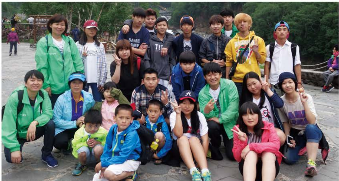
Group photo marking Baekdusan climbing.

Press 6 after hearing the ringing sound related to contents (International Projects Department)