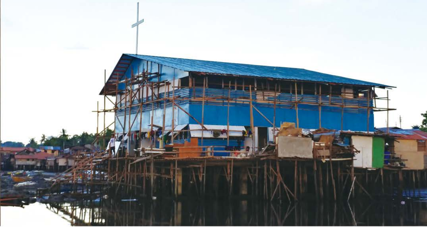
Community center nearing completion

know that they keep me on the edge of my seat, but they seem to enjoy their breaks from their work.