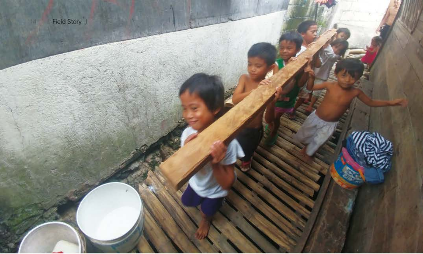
Children carrying wood