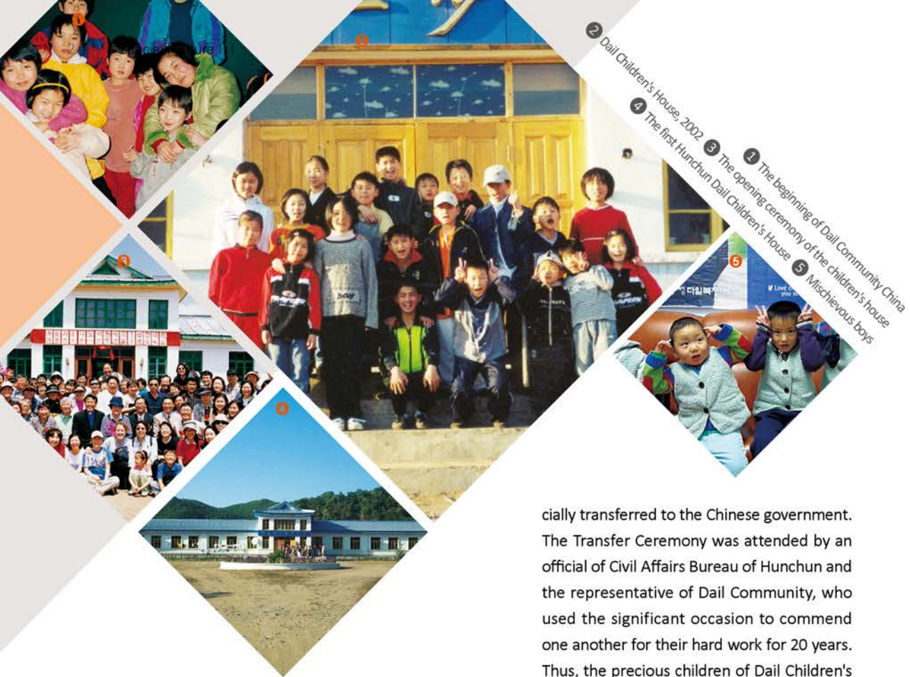
1 The beginning of Dail Community China 2 Dail Children's House, 2002 3 The opening ceremony of the children's house 4 The first Hunchun Dail Children's House 5 Mischievous boys