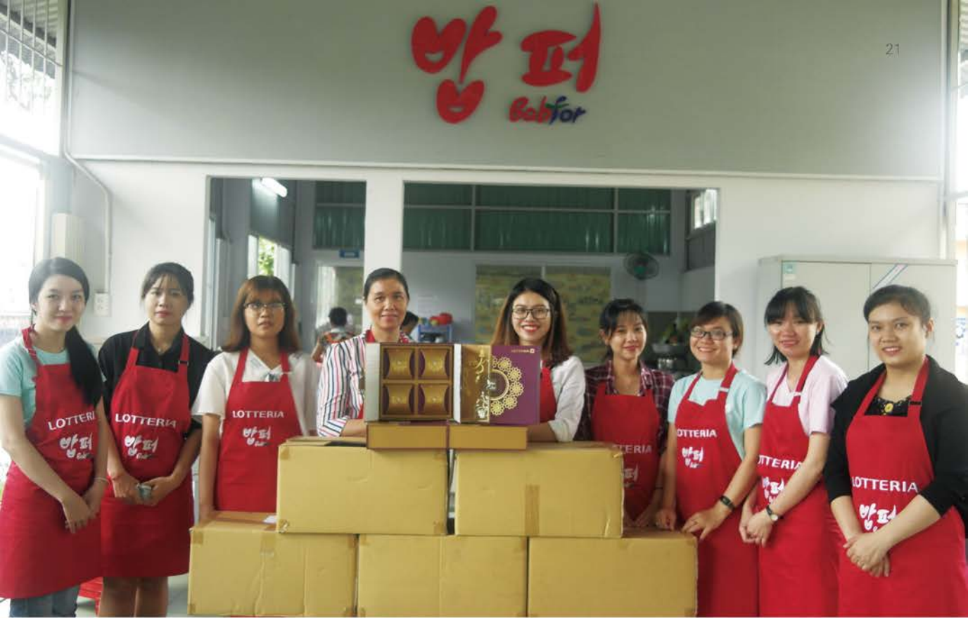
Bountiful Moon Cake sharing at Lotteria.