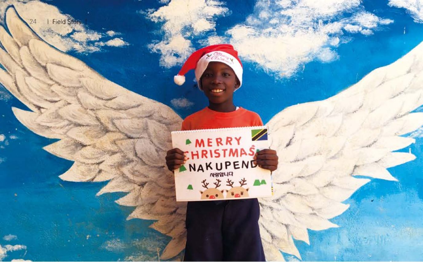
Merry Christmas and I love you!