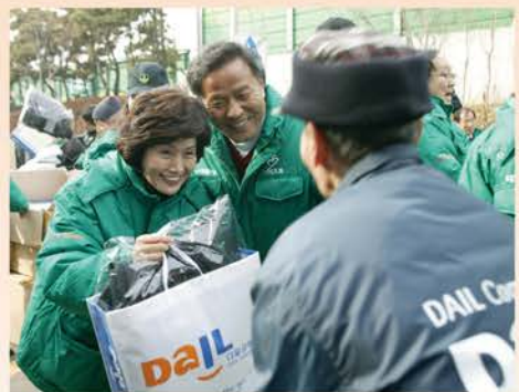
Christmas gifts being presented to seniors at the end of the Street Christmas Chapel.

On December 25, there will be Babfor 30th Anniversary Street Christmas Service for disadvantaged neighbors. During the service, we will deliver Winter Warmer packages to the homeless and elderly people. And we are waiting for people to support these warm-hearted Christmas gifts for our 3,000 disadvantaged neighbors! A Winter Warmer package includes a winter jacket, pair of socks and gloves, lunch box, snacks, water and a hot pack. Each package is priced at 50,000 Won, and 30,000 Won for the winter jacket, only. If a lot of people contribute their warming hearts, wouldn't this Christmas a bit warmer? We hope and wait for new miracles of gratification and love. We need your support! (Hana Bank 630-007015-512, Dail Community/Babfor +82 2-2214-0365)