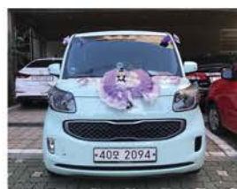
Wedding car for the trip