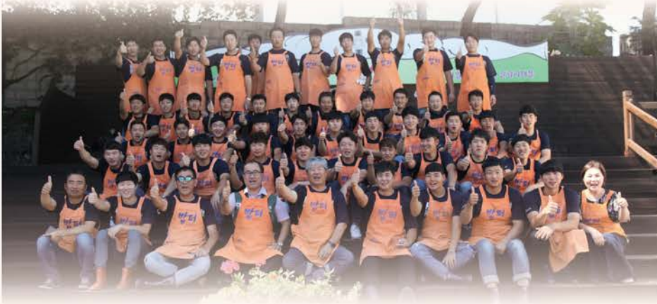
With NC Dinos members at the end of Babfor volunteering

On Sep. 14, Babfor Sharing Campaign Headquarters was visited by the members of NC Dinos now affiliated with the Futures League of South Korean professional baseball, who joined the warm-hearted sharing. Even though autumn had officially started, it was quite warm during the day. Still, the athletes fulfilled their job excellently while sweating out, which drew praise from elderly people who visited Babfor.