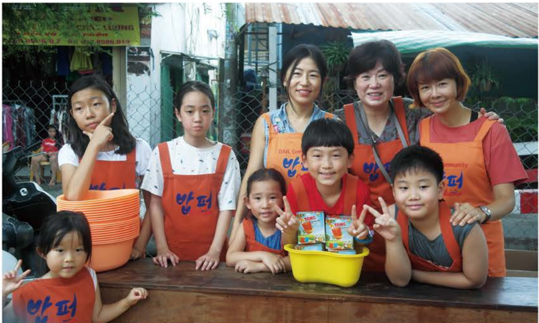
Believers of Chamjoewn Gwangsung Church.

In Vietnam, they call mid-autumn harvest festival Tet Trung Thu. As people in Vietnam engage in harvesting all year round, Tet trung Thu is in fact different from the Chuseok of Korea and is similar to the Korean holiday, ‘Children’s Day’. On this day, Vietnamese people distribute delicious food and heart-laden gifts to children. Or, they express their gratitude to their acquaintances by sharing ‘Moon Cake’.