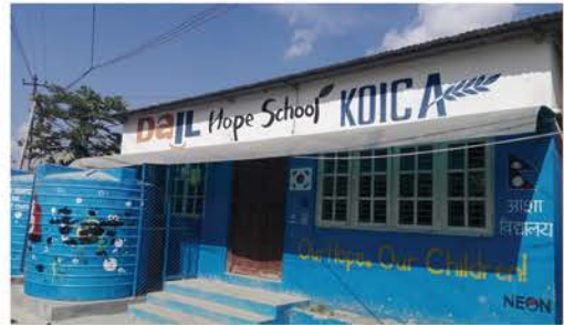
Nepal Dail hope school

Below are the names of our 11th graders.