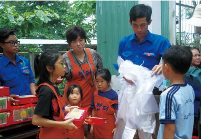
Chamjoewn Gwangsung Church sharing 'Moon Cake'