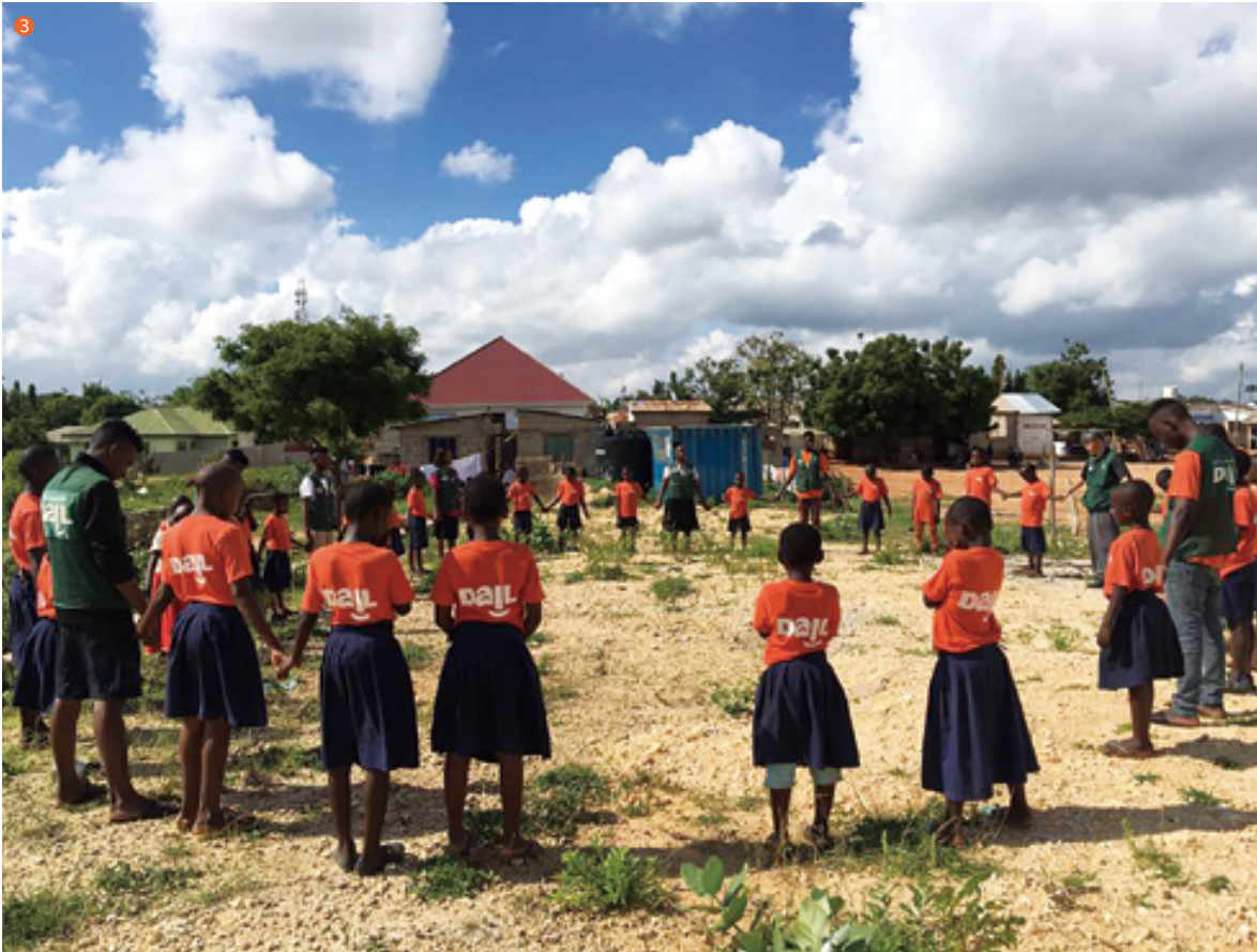
② Students of the 4th Hope Class taking the graduation exam ③ Children and staff praying for the establishment of Dail Vision Center at the construction site