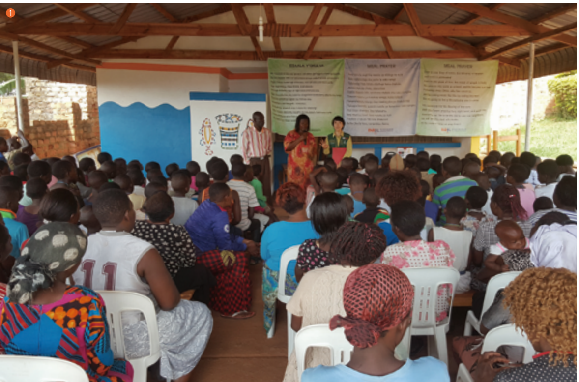
1 Parents of students at Babfor Center

We signed a written agreement, stating that we will fulfill our respective responsibilities and provide full cooperation with an understanding of our respective roles. We ask that you take an interest in and encourage us as we endeavor to help out-of-school children return to school to receive universal elementary education and grow into healthy members of Ugandan society and global citizens.