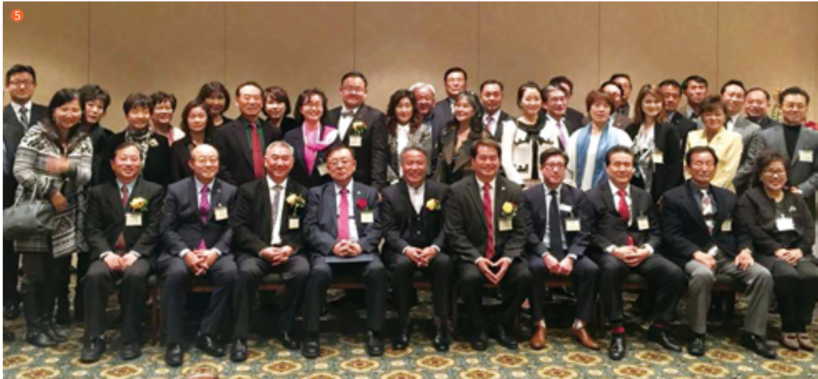
④ Sharing Thanksgiving groceries ⑤ At the CBMC meeting