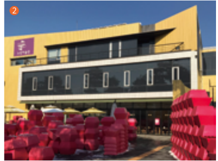
①, ② Heyri Art Valley in Paju