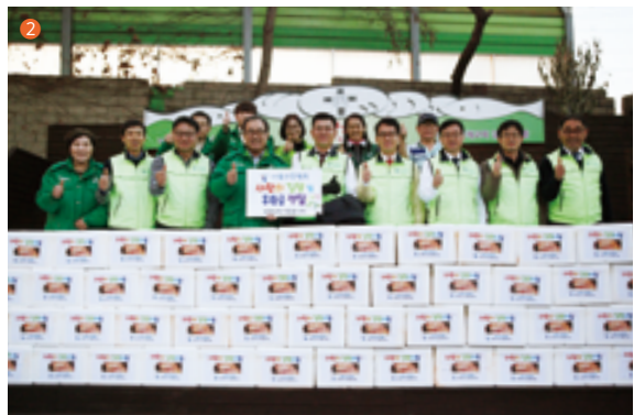
1 2 Umyeon Nuri Volunteer Corps of Seoul High Court