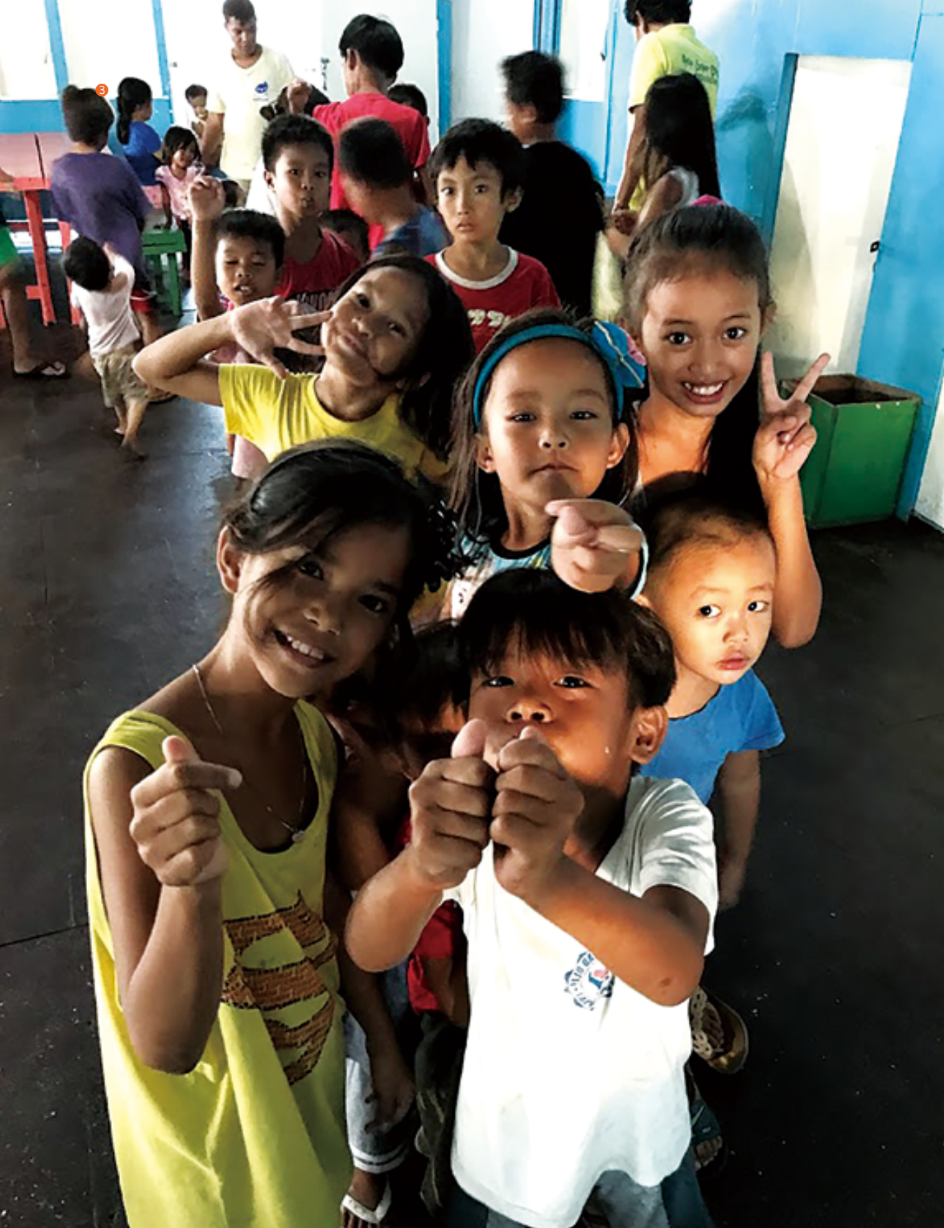
③ Children welcoming the volunteer team