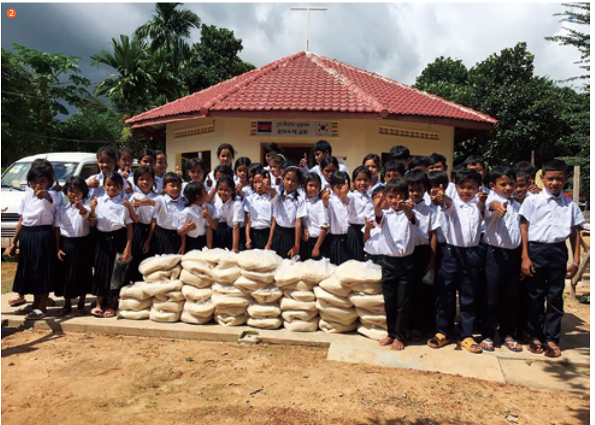
①, ② Children with new school uniforms