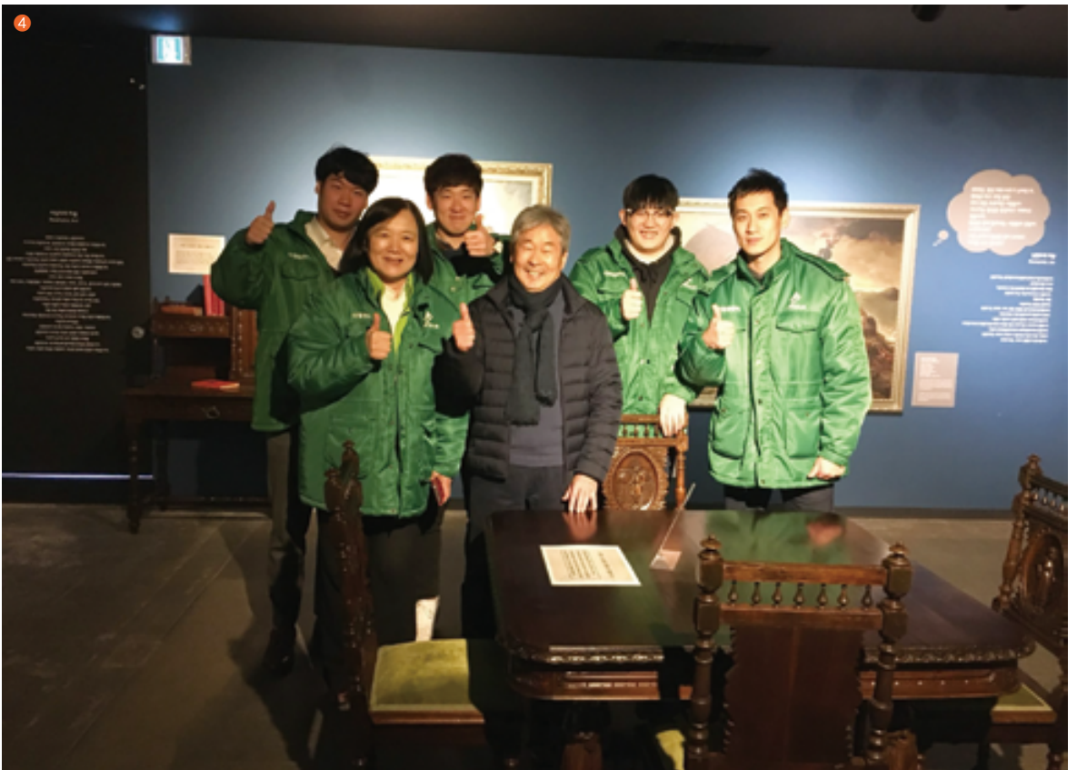
③ Patients listening to the instructor ④ At the Yellow Art Travel Museum