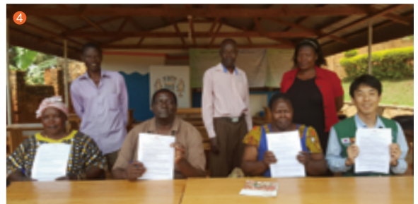
② Children carefully looking at the photographs of themselves ③ Delivery of donated goods ④ Group photo after the conclusion of the written agreement