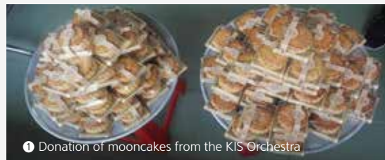
① Donation of mooncakes from the KIS Orchestra