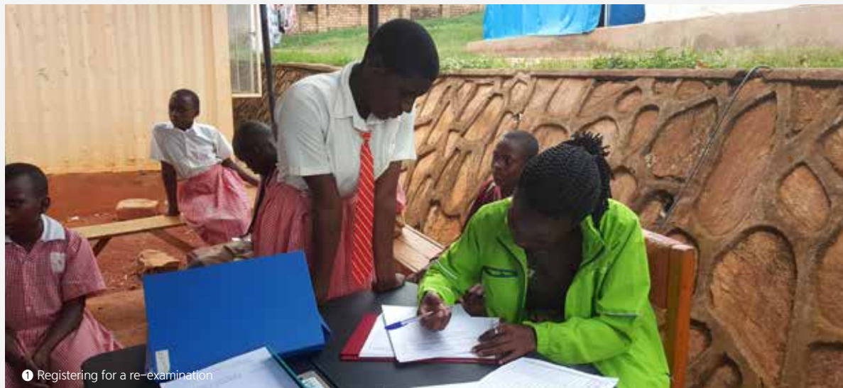
1 Registering for a re-examination

Also, eight children were found to have poor vision, requiring glasses. Fortunately, there is a public health center near Kitiko Primary School