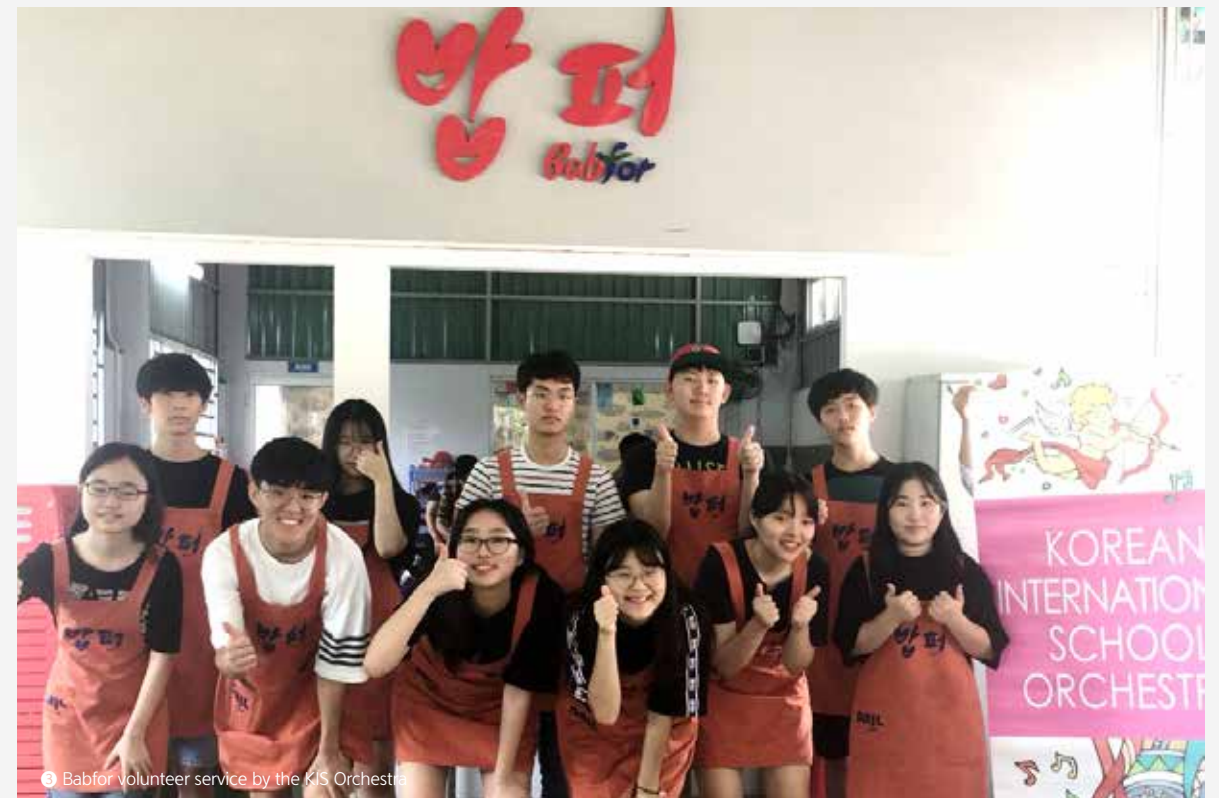
③ Babfor volunteer service by the KIS Orchestra