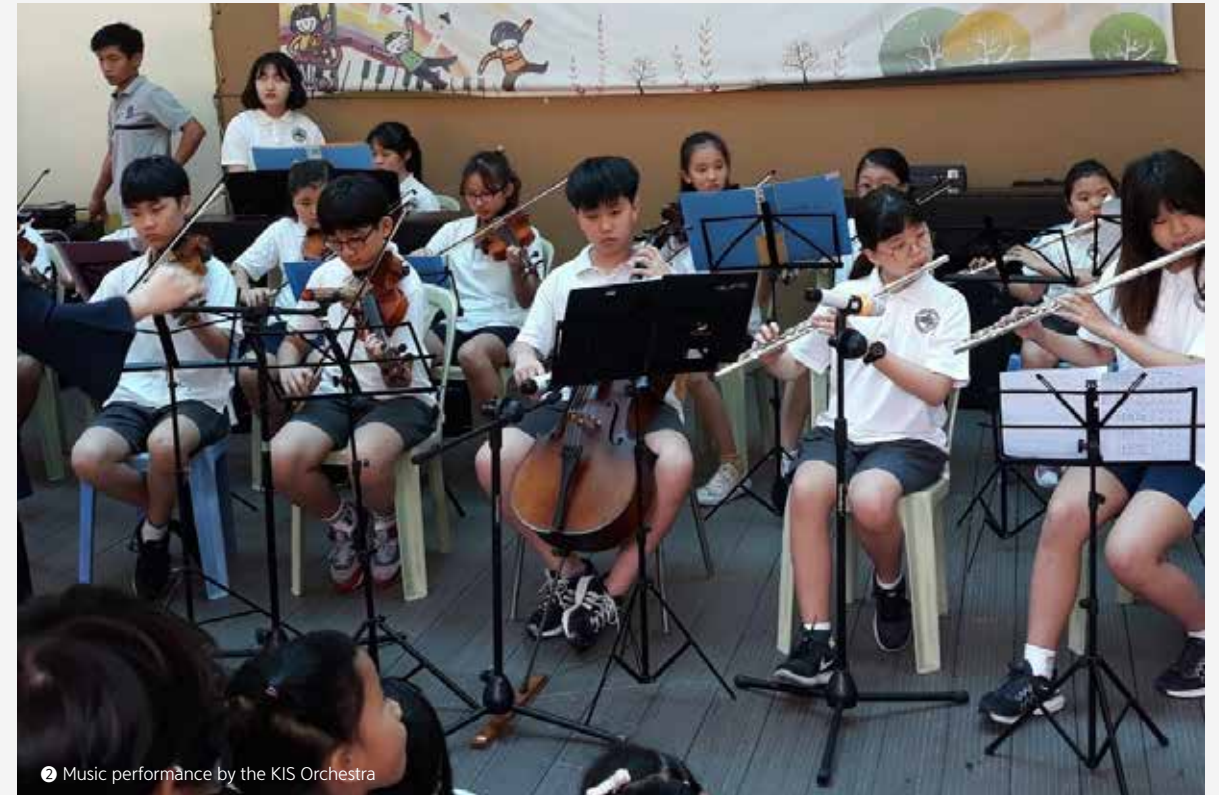
② Music performance by the KIS Orchestra

Details – extension no. 6 after connection (International projects office)